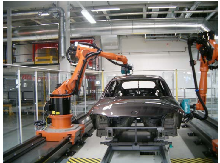
Arm Tool (EOAT) with integrated distance sensing.

Systems can be configured with single or multiple robots. Each robot utilizes a single PELT sensor End of